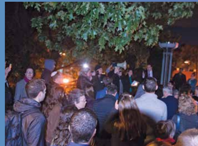
Thousands of additional community members participate in an impromptu overflow service outside of the Tree of Life vigil inside Adas Israel.