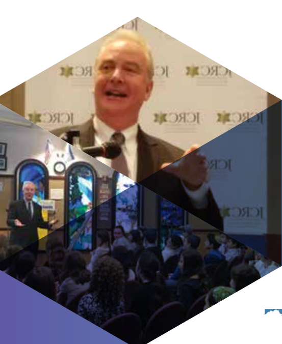
Maryland Senator Chris Van Hollen addressing JCRC activists at the Maryland Legislative Breakfast. Senator Van Hollen also accompanied the JCRC on a visit to 5th graders at the Charles E Smith Jewish Day School.