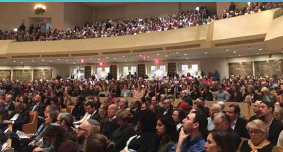
Thousands of community members gather at the JCRC vigil to mourn the Tree of Life shooting.