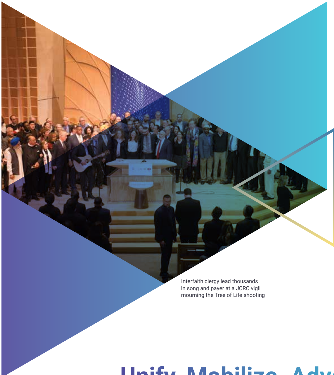
Interfaith clergy lead thousands in song and prayer at a JCRC vigil mourning the Tree of Life shooting