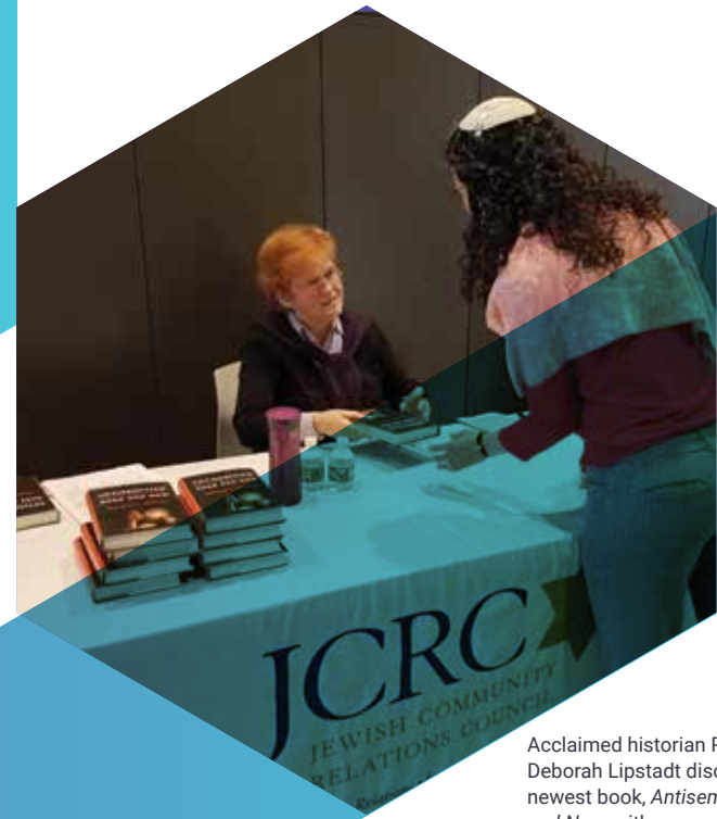
Acclaimed historian Professor Deborah Lipstadt discussed her newest book, Antisemitism Here and Now , with community leaders and elected officials.