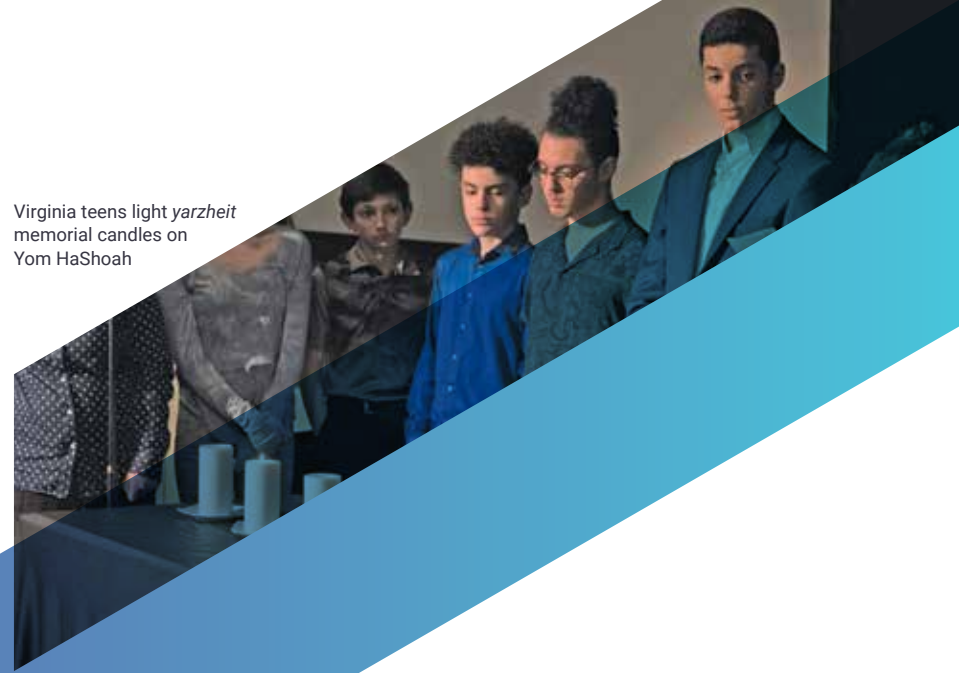
Virginia teens light yartzheit memorial candles on Yom HaShoah