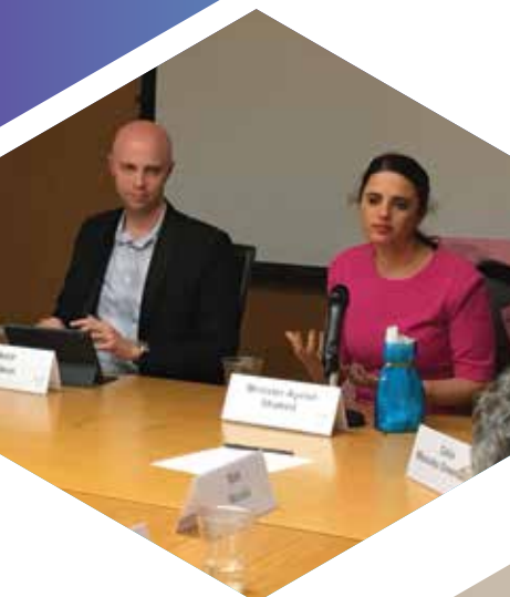
Israel's Minister of Justice Ayelet Shaked briefs JCRC leadership.