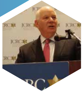
Maryland Senator Ben Cardin addressing JCRC activists